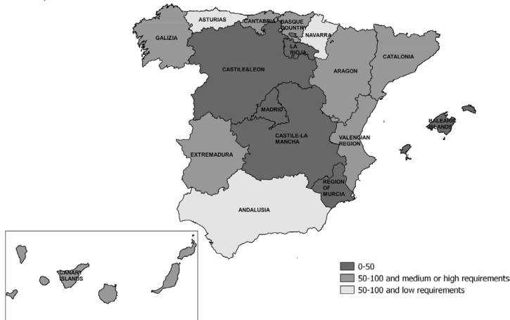
Figure 2: Scores of regional health care policies after RDL 16/2012 (until 2015) 103