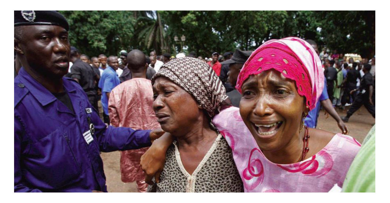
Women at Conakry's mosque as she they look for the bodies of family members and friends that were killed during a rally on September 28, 2009.

Here, I would like to describe the sexual violence committed but different to the rape. Witnesses testified that women were abused by security forces (generally by the red beret and gendarmes). For example, they testified that women "were underdressed, often by force, and the use of knives and even scissors in some cases. They were forcibly touched in the vagina, breast and buttocks area. At least five of them were beaten in the abdomen and genital area with batons clubs, rifle butts or knives"<sup>27</sup>. The commission confirmed that twenty one cases of sexual violence other than rape were committed in the stadium. Moreover, many women lost their clothes and left the stadium half or completely naked. For many witnesses, that attended the demonstration, the pain experienced by women that day is indescribable. However, the most common sexual violence used by security forces was rape.