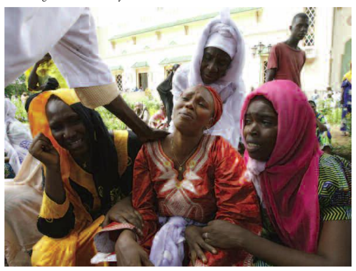
Guinea: Bloody Monday/ The September 28 Massacre and Rapes by Security Forces in Guinea . In Guinea the discrimination between man and woman persists despite the large number of legal instrument prohibiting this practice. According to the alternative NGO report on

Most of the victims alleged feeling profound levels of shame and humiliation, after the event. Some of them were rejected by their family members. According to the Guinean culture it is unacceptable to share a house with a woman who has being raped by somebody else, a woman who becoming pregnant without being married and a woman that having contracted sexually transmitted diseases such as HIV.