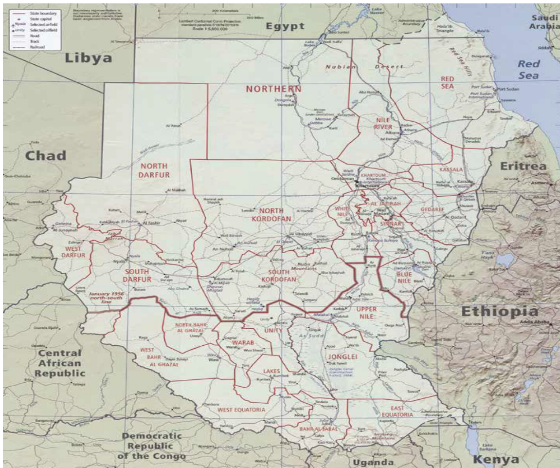
Fig. 1. Political Map of Sudan/South Sudan