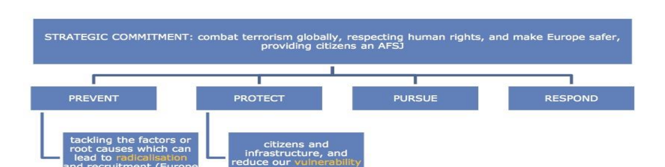
Chart 6: EU's 2005 counter-terrorism Strategy strategic commitment

Regardless of the absence of references to vulnerability in connection to groups or individuals, the 2005 Strategy makes reference to 'root causes', in connection to 'Prevention'. This reference, however, is linked to a very different notion: 'radicalisation'. It further states that there are 'conditions in society which may create an environment in which individuals can become more easily radicalised', and enumerates: