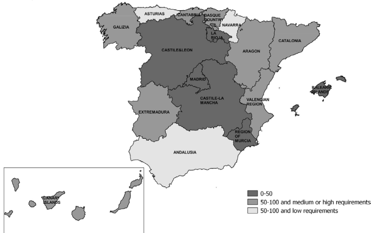
Figure 2: Scores of regional health care policies after RDL 16/2012 (until 2015) 103