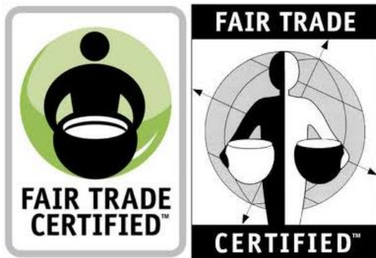
Figure 2: Fairtrade USA Logo, downloaded from the Global Exchange Website 116

Starbucks has an image of a good company, a company that cares about its community and about the world. With this brand identity, Starbucks creates a sort of trust with its consumer. With all the confusion around the concept of Fair Trade, should consumers