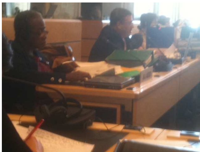
Photo 6: 63 rd Session of the Committee on the Rights of the Child: meeting on Guinea-Bissau. (Geneva. 7 June 2013)

I had the opportunity, thanks to the support of the Human Rights Centre of Padua University, to personally attend the meeting on Guinea-Bissau held at the OHCHR in Geneva, on 7 June 2013 98 , in the framework of the 63 rd Session of the Committee on the Rights of the Child. Besides the most updated information on the CRC in Guinea-Bissau in the backstage of the 63 rd . Session.