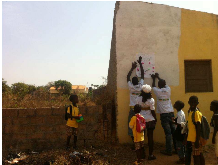
Photo 13: This picture was taken by Grupo Arte Simples de Teatro during their cooperation mission in Bissau. The children of RCJJ jointly produced posters related to the environment and children's rights and after learning Brazilian community drama techniques they did an "art possession" for their rights in community of Quelelé in order to mobilize other children. (Bissau. 31 January 2012).

Regarding Educommunication methodologies, RCJJ is very rich and organized in the way they committed work for the promotion of the participation of children, however, their work could have a higher penetration in the country with they have financial resources that allow them to have some material to work, to provide minimum conditions for the children involved in their projects. Many of them goes on Sunday meetings without a meal and water for the day. The same problem faced by Paulo Freire 40 years ago while implementing his literacy methods: lack of resources.