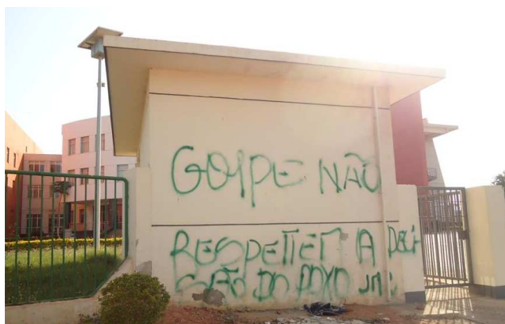
Photo 4: Picture three days after the Military Coup of April 2012. This is the building of the National Popular Assembly in Bissau. The sentence in Portuguese means; “No Coup. Respect the people’s decision”. (Bissau. 15 April 2012)

In the evening of the coup, I was in a restaurant in Bissau, the capital, with friends around 7 p.m when suddenly people started running around screaming that the militaries were in the streets heading the house of the Prime Minister Carlos Gomes Júnior, which was around three blocks away from there. The first thing done by the group was going straight home to turn on the United Nations radio in order to have some information. The fear was that the military could break down the electricity right away. On that night, the instability was felt in very realistic way. If you do not have water, food, a charged mobile, a radio with battery, you feel how easily and suddenly you can be put in a situation of extreme vulnerability. You, meaning a person from the international community. For the local population, the fear is mixed with the conformation with an instability scenario that is not recent. In that evening, part of the population started running away from Bissau with their families to the rural and poorer regions of the country.