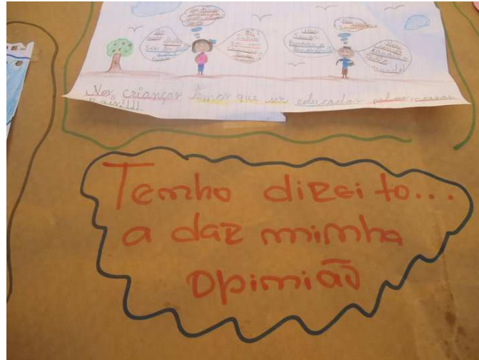
Photo 5: Poster for the dissemination of the CRC made by children at the Brazilian Embassy in Bissau on the celebration of the African Children's Day. The sentence in Portuguese means: "I have the right to give my opinion". (Bissau, 15 June 2011)