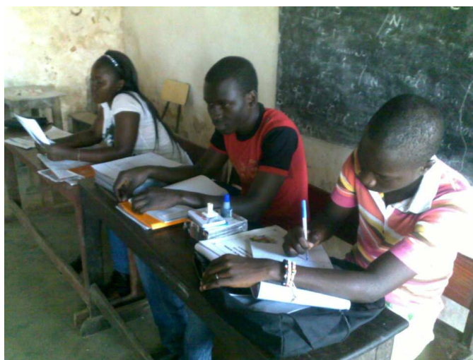
Photo 12: The three children that coordinates RCJJ during their meeting held in a Sunday afternoon in a public school in Bissau. The conditions of the schools are precarious. (Bissau. 3 March 2012).

“Communicational Ecosystem” 168 . Since 2009, RCJJ does not have any fixed financial support. There is no budget for the water and snacks for the around 25 children that meet on Sundays afternoons in an old room of a public school without electric energy and part of the ceiling. There is no headquarter nor space to keep their material. 169