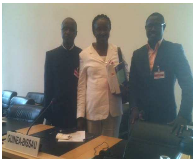
Photo 7: Delegation of Guinea-Bissau during the meeting of the 63 rd . Session. (Geneva. 7 June 2013).

he heard the information about the children who works in network for the promotion of the CRC in Guinea-Bissau, he recall for the positive experiences of many youth and children network that now are very sustainable in Brazil. He made accomplishments to the work developed by Magazine Viração which is one of the Educommunication experiences addressed here in Chapter 5.