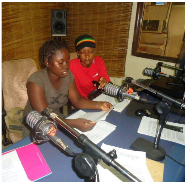
Photo 11: Two girls members of RCJJ producing their weekly radio program at Radio Bombolom about the rights of the child, focus on child nutrition. (Bissau. 16 October 2011).

At this point of the Thesis, some concepts of Educommunication were presented, the main challenges of the implementation of the CRC were addressed and the main results achieved with some Brazilian successful experiences on Educommunication were shared. Now, it is time to call attention for one experience developed in Guinea-Bissau: the Children and Young Journalists Network of Guinea-Bissau (RCJJ).