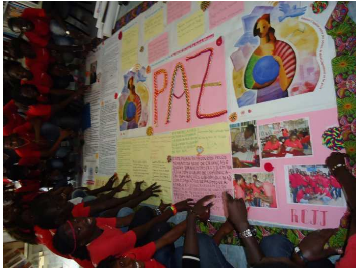
Photo 8: Big poster for peace produced by the children of RCJJ. (Bissau. 19 September 2011).