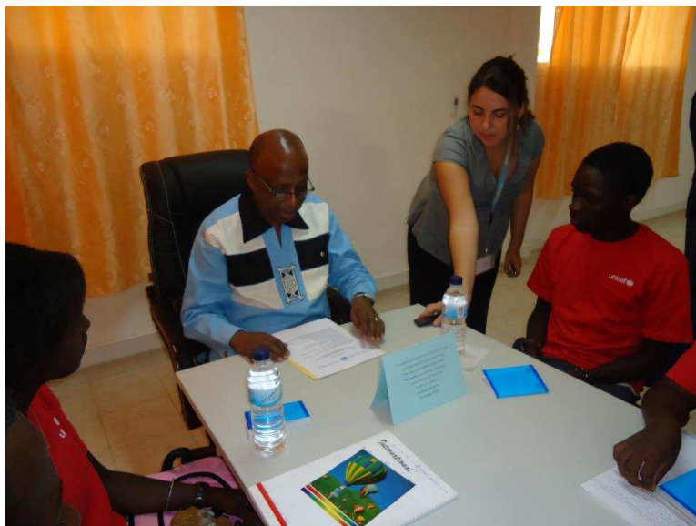
Photo 2: RCJJ in a meeting with the Special Representative of the UN Secretary-General (at that time) for the dialogue about the children and youth participation in the peacebuilding process in the country. (Bissau. 20 September 2011).

building on Educommunication to enable them to actively participate in the implementation of the UN official agenda in the country.