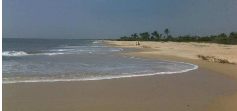
Photo 3: Varela Beach in Guinea-Bissau, a country with huge quantity of natural resources. (Varela. 3 March 2012)