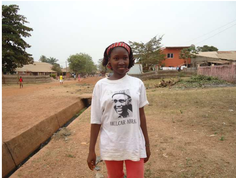
Photo 9: Cabral's image remains until the new generation in Guinea-Bissau. A teenager who lives in the community Tchada wears a T-shirt with Amilcar Cabral photo. (Bissau. 21 January 2011).

education is recognized in Article 26 of the Universal Declaration of Human Rights 1948 as the right of everyone to the full development of the human personality and as a necessity to strengthen the respect for fundamental rights and freedoms. The achievement of this right depends on universal access to basic education, the right to education but not limited to access, permanence and completion of this level of education: it presupposes conditions to continue studies in other levels” 161 .