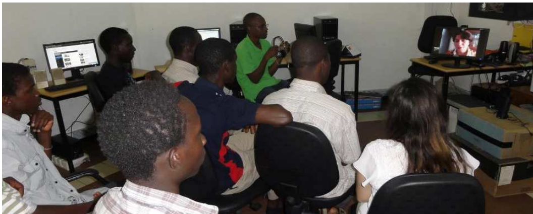
Photo 10: Teachers attending a lecture through Skype provided a Brazilian teacher during the pilot course on Educommunication at the Brazilian Embassy in Bissau. (Bissau 21 November 2011).

teachers to the main concepts of Educommunication , with a special focus on the use of the radio in classrooms activities, taking into account that radio is the most used media in the country. The activities were partly conducted on a distance educational platform of the Ministry of Education of Brazil and, partly, composed by practical experiences on Educommunication , including collective radio production, meeting with youth, in order to make the teachers learn Educommunication in context.