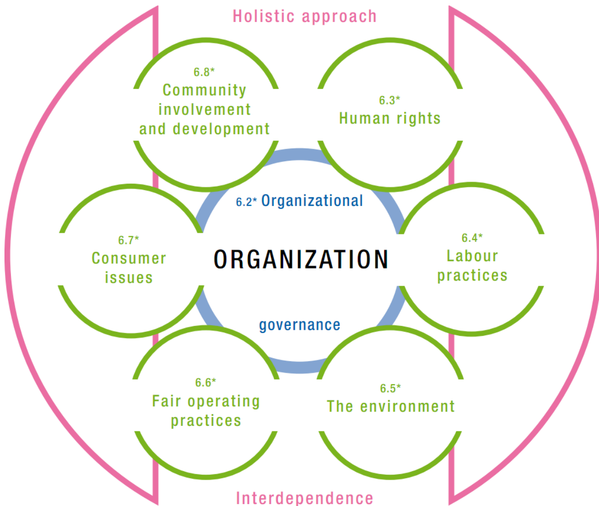
Figure 2: The seven core subjects – specific numbers refer to corresponding Clause numbers in ISO 26000

practices (Clause 6.6); consumer issues (Clause 6.7); and lastly, community involvement and development (Clause 6.8). 653 The core subject matter is treated holistically and as (mutually) interdependent. The text of the core subject begins with a descriptive ‘Overview’ of the theme of the relevant Clause. It then proceeds to outline ‘Principles and considerations where needed. This is followed by a series of ‘Related actions and expectations’. There follows a brief discussion of the following three core subjects: Clause 6.2 on Organization governance; Clause 6.3 on Human rights; and Clause 6.4 on Labour practices.