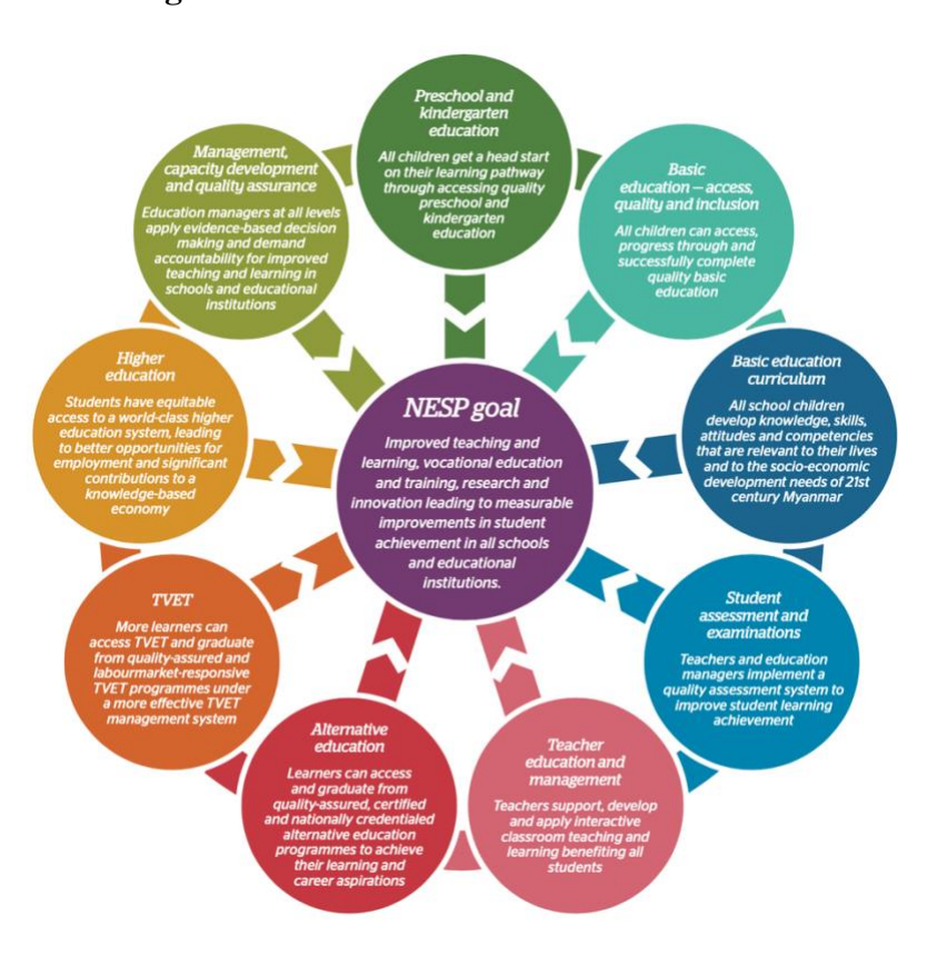
Figure 4 - NESP Goals