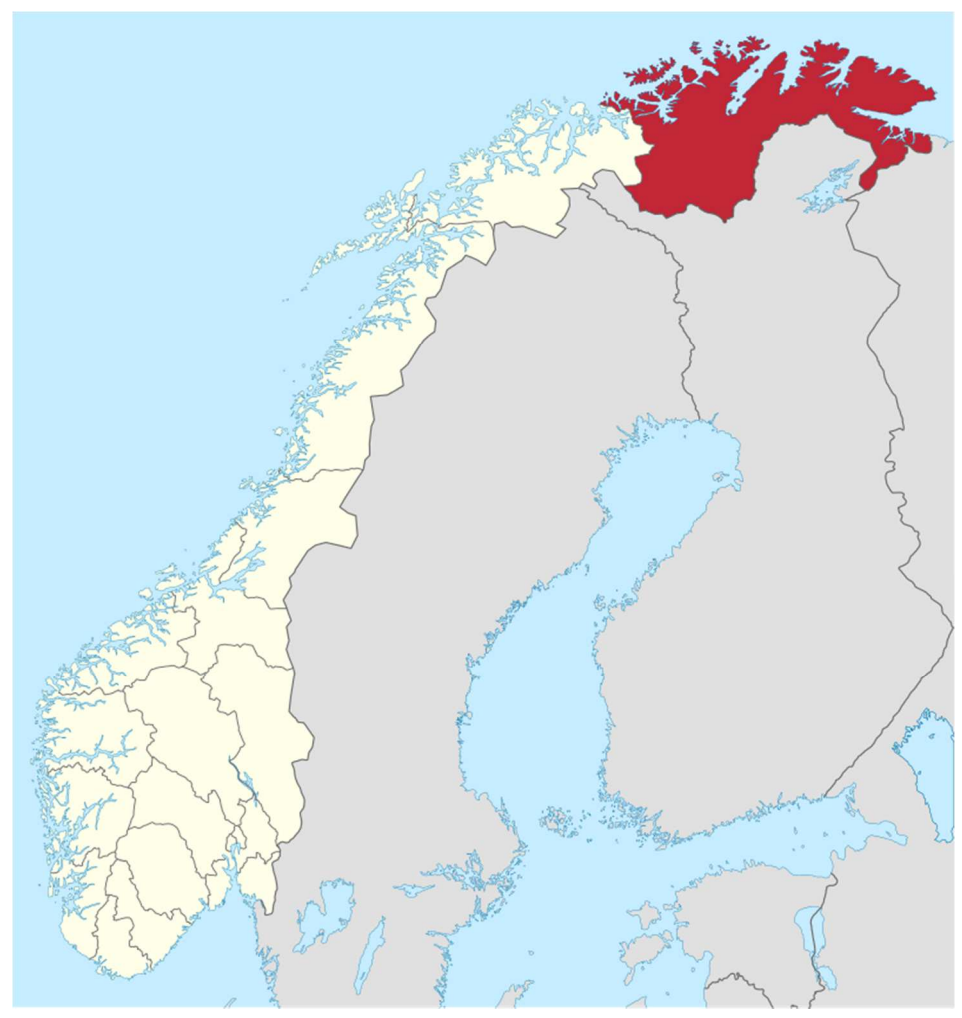
Annex No. 3 – In red the Finnmark area.

http://it.wikipedia.org/wiki/Finnmark (accessed on 7/6/2014).