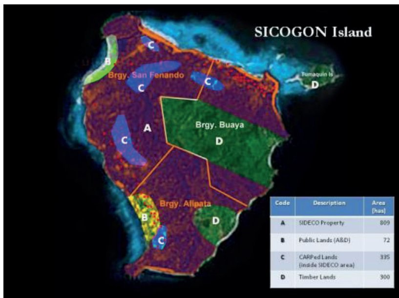
Map 1: map of Sicogon Island (PROGRESO, 2008)