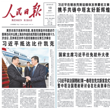
Left: One of the headlines of People's Daily , a newspaper in Mainland China